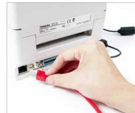
Built-in networking as standard with a 10/100Mbps LAN interface