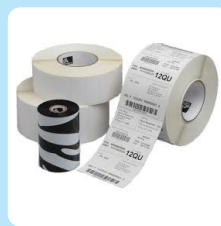
Consumables (labels, ribbons, PVC cards)