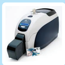
PVC card printers