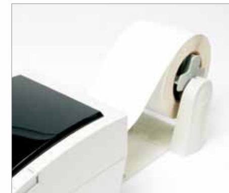
A wide range of options, including an external media stand