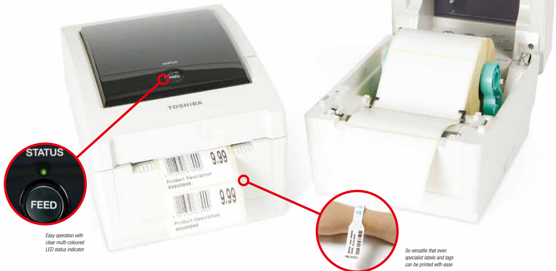
Easy operation with clear multi-coloured LED status indicator