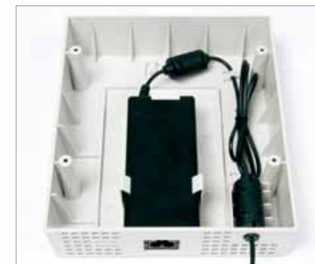
An optional power supply tray for retail installations