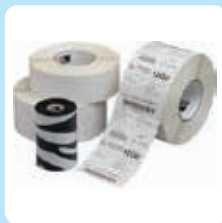
Consumables (labels, ribbons, PVC cards)