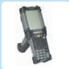
Data terminals & PDA